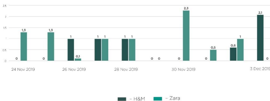
New Arrivals- in % of assortment

Market timing is an important part of Inditex's strategy, as confirmed by its subsidiary Zara, which went as far as to allow its customers to prepare and save their shopping carts a few hours before the savings event was launched.